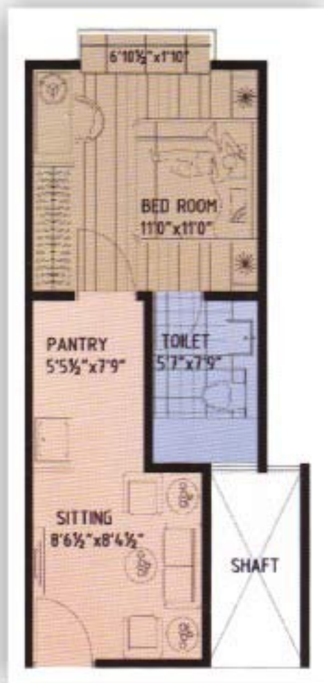
CORRIDOR 5'0" WIDE Area 390.00 Sq.Ft.