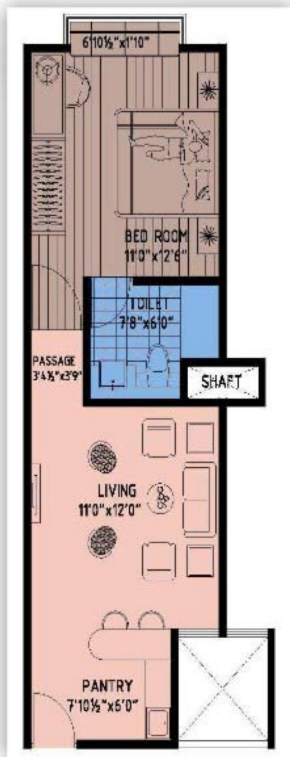
CORRIDOR 5'0" WIDE Super Area 550.00 Sq.Ft.

*Limited Flats of 2 BHK (750 Sq. Ft.) are also available